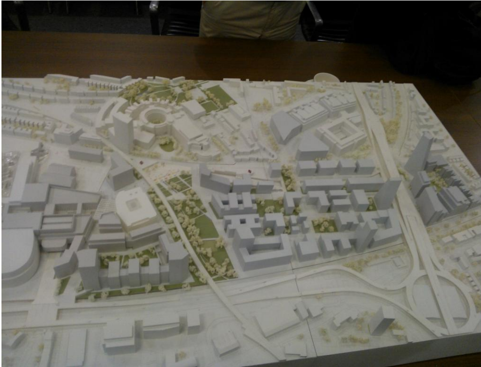
White City Opportunity Area Latest Proposals