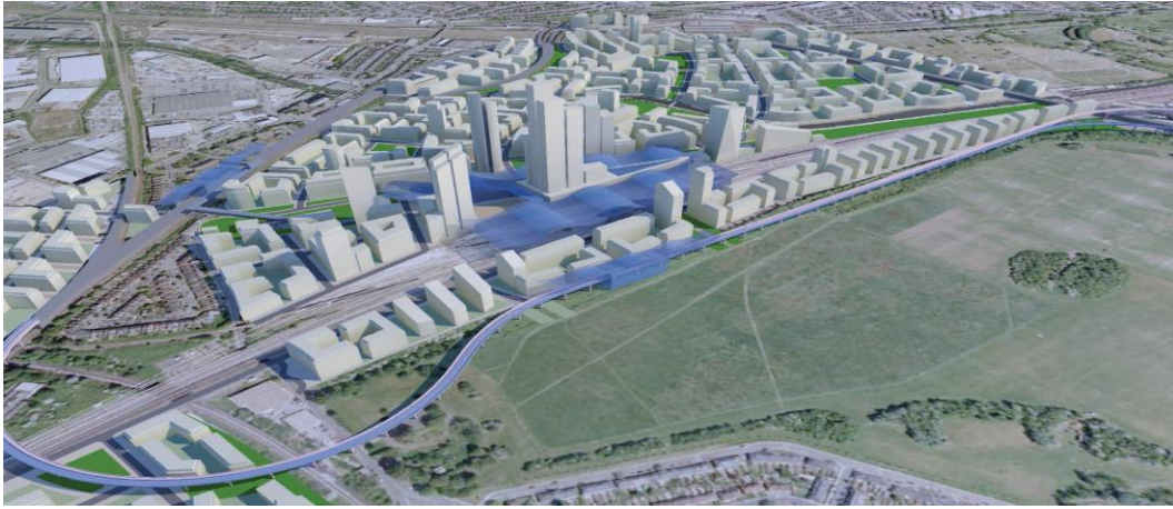
Aspirational image of Old Oak in 2042 (from Mayor's vision document)