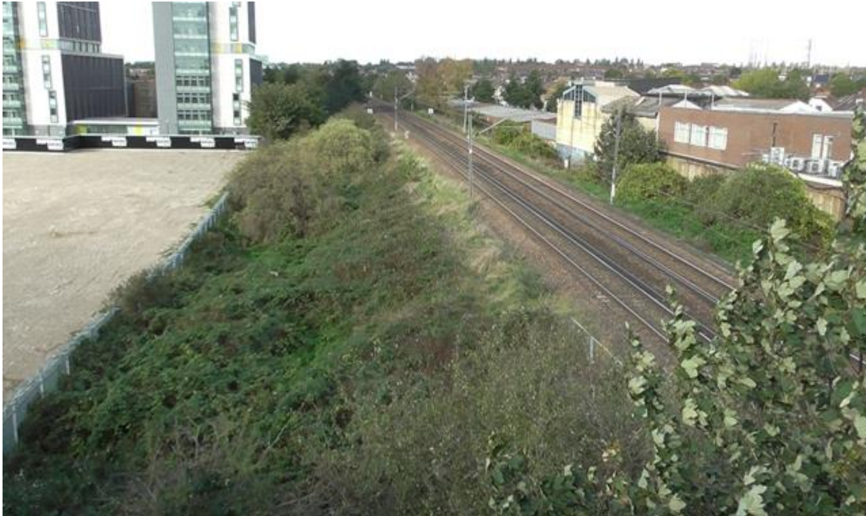
Suggested site for Overground station at Westway Circus (looking north, at site of proposed underpass at Imperial West)