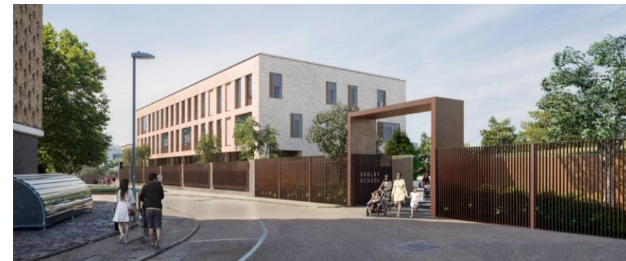
New school seen from Treverton Street