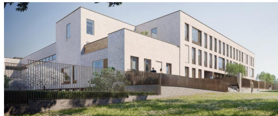
New school seen from Treverton Estate