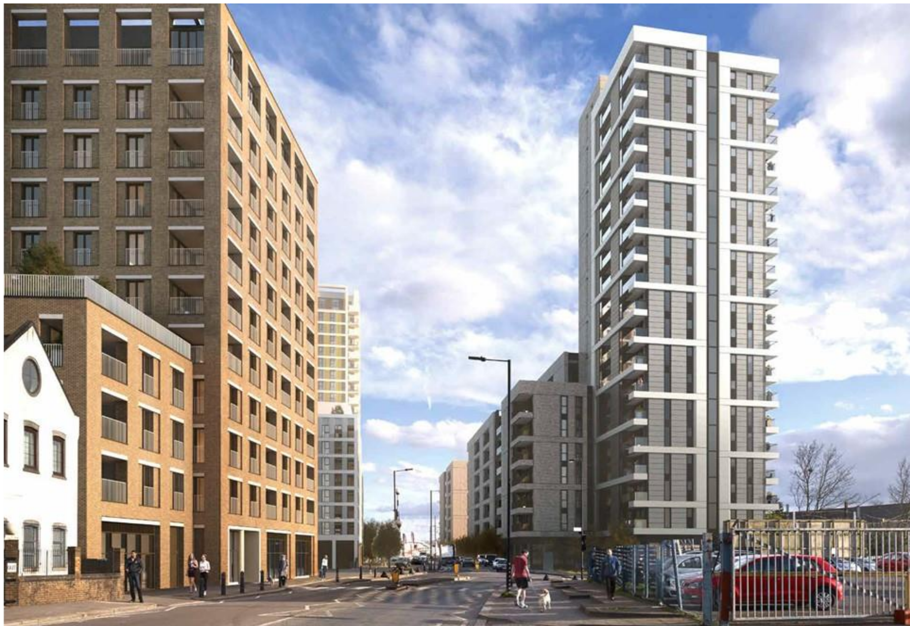
North Kensington Gate on left, proposed Mitre Yard scheme on right, looking south on Scrubs Lane