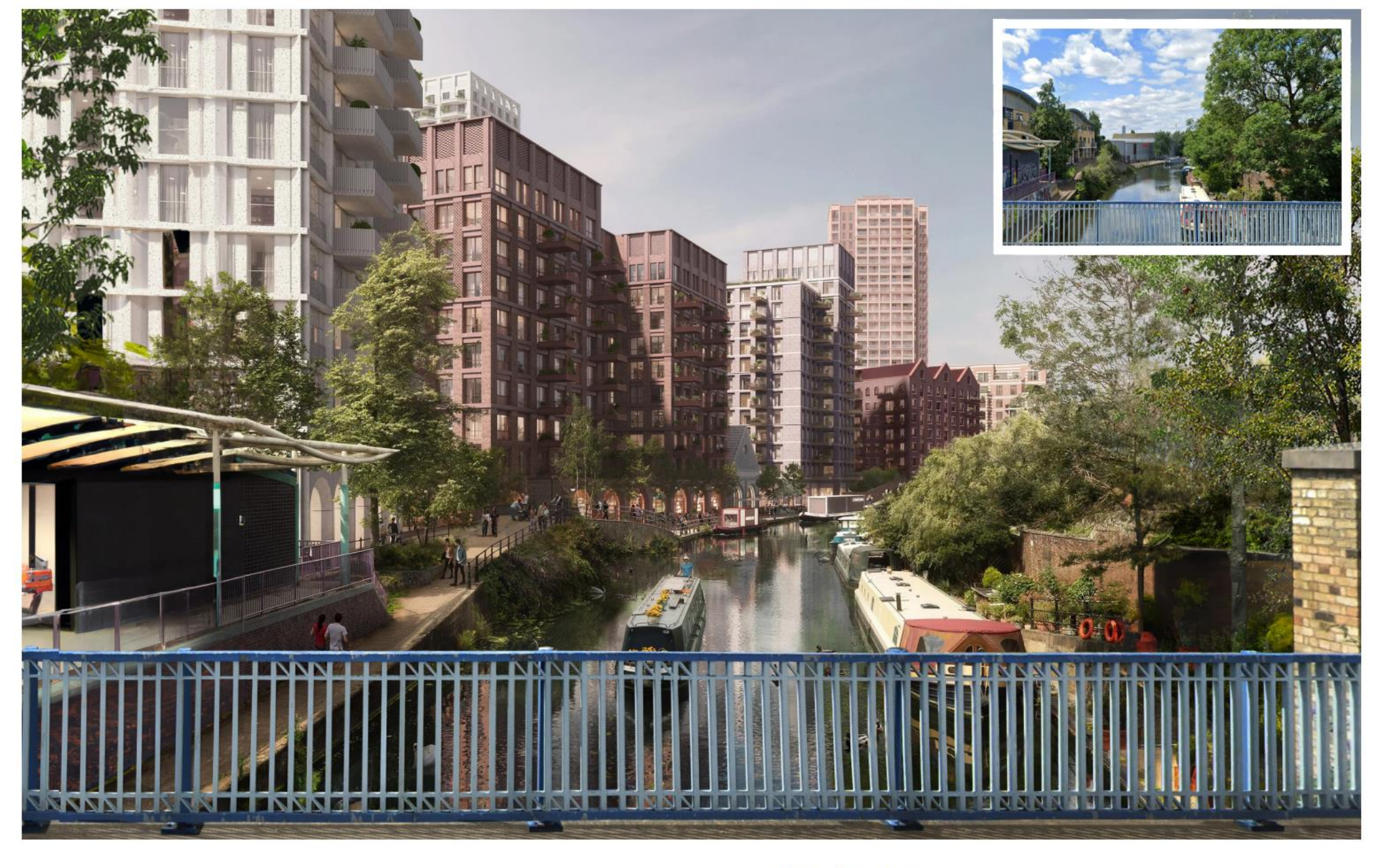
The canalside fringe as viewed from the Ladbroke Grove road bridge.