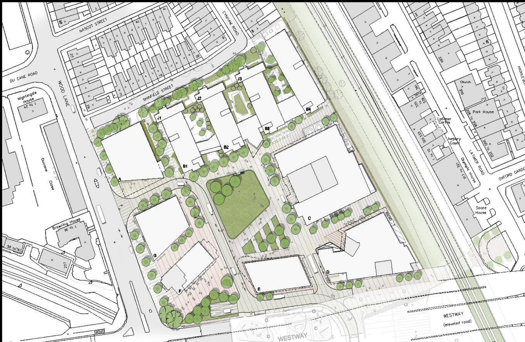
Imperial West masterplan