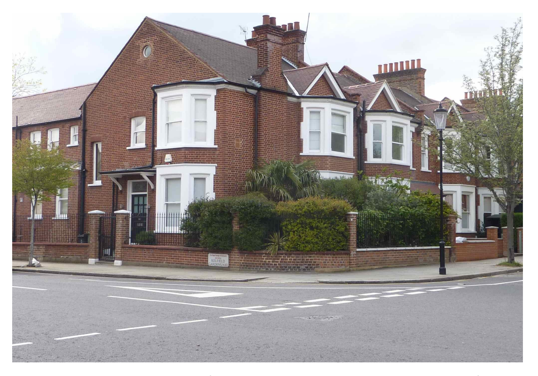
Front boundary wall/railings max 1.5m high