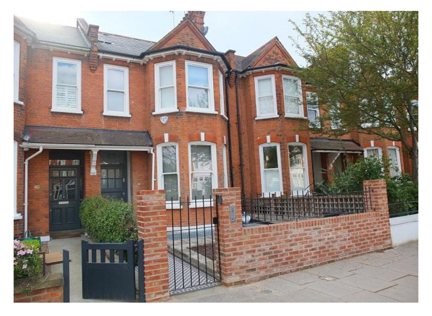
Front boundary wall/railings max 1.5m high Yes/No?