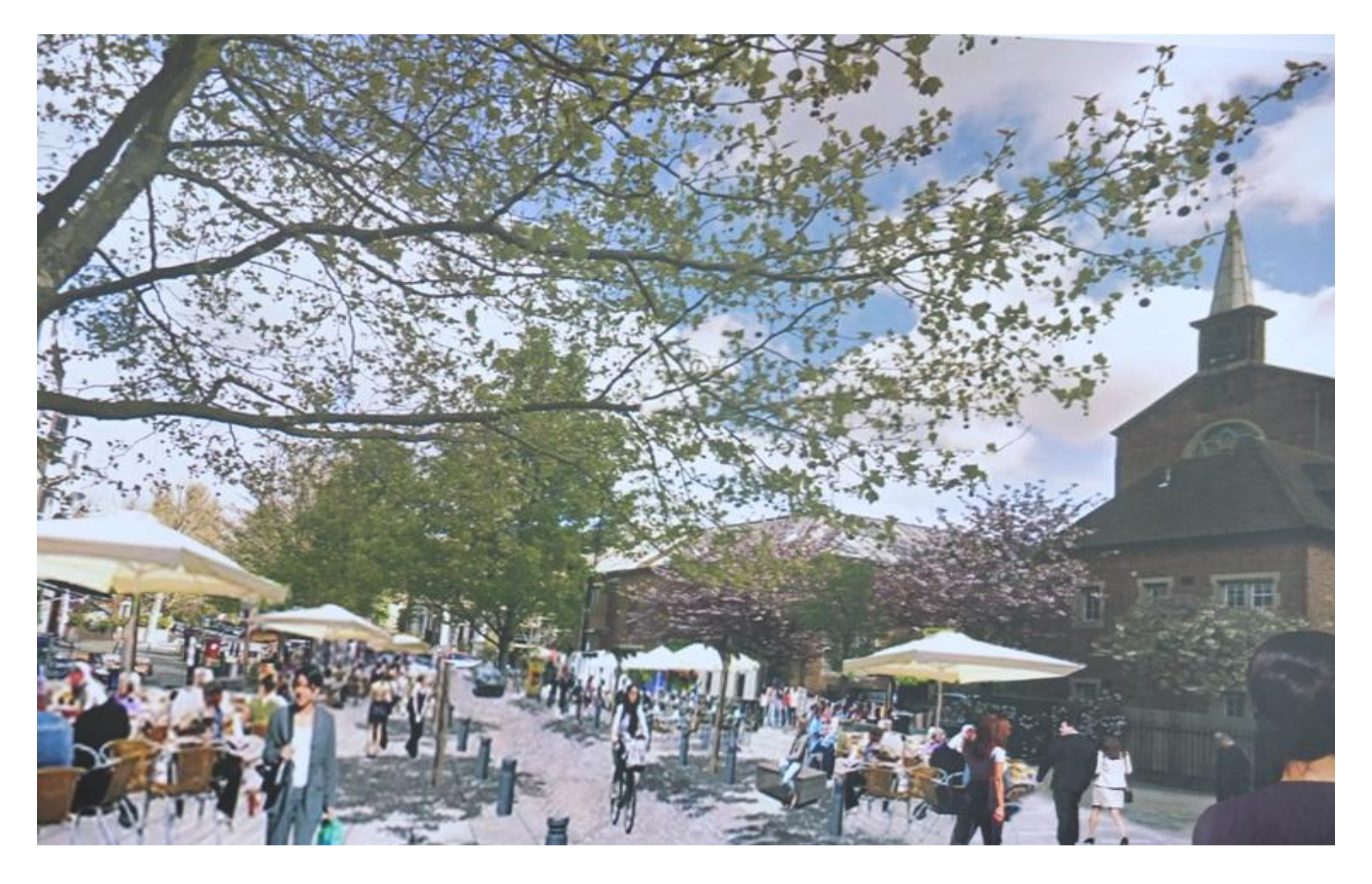
A traffic free St Helens Gardens at weekends – with a Farmers Market?