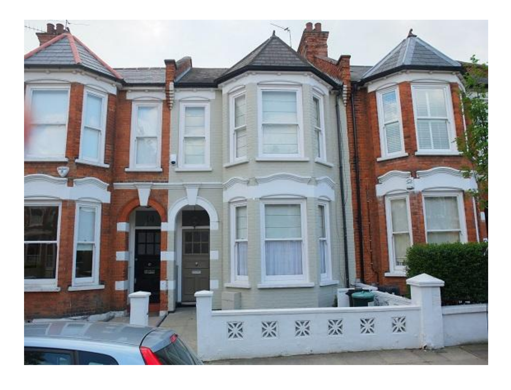
Painting of 'red brick' facades (currently permissible) Yes/No?