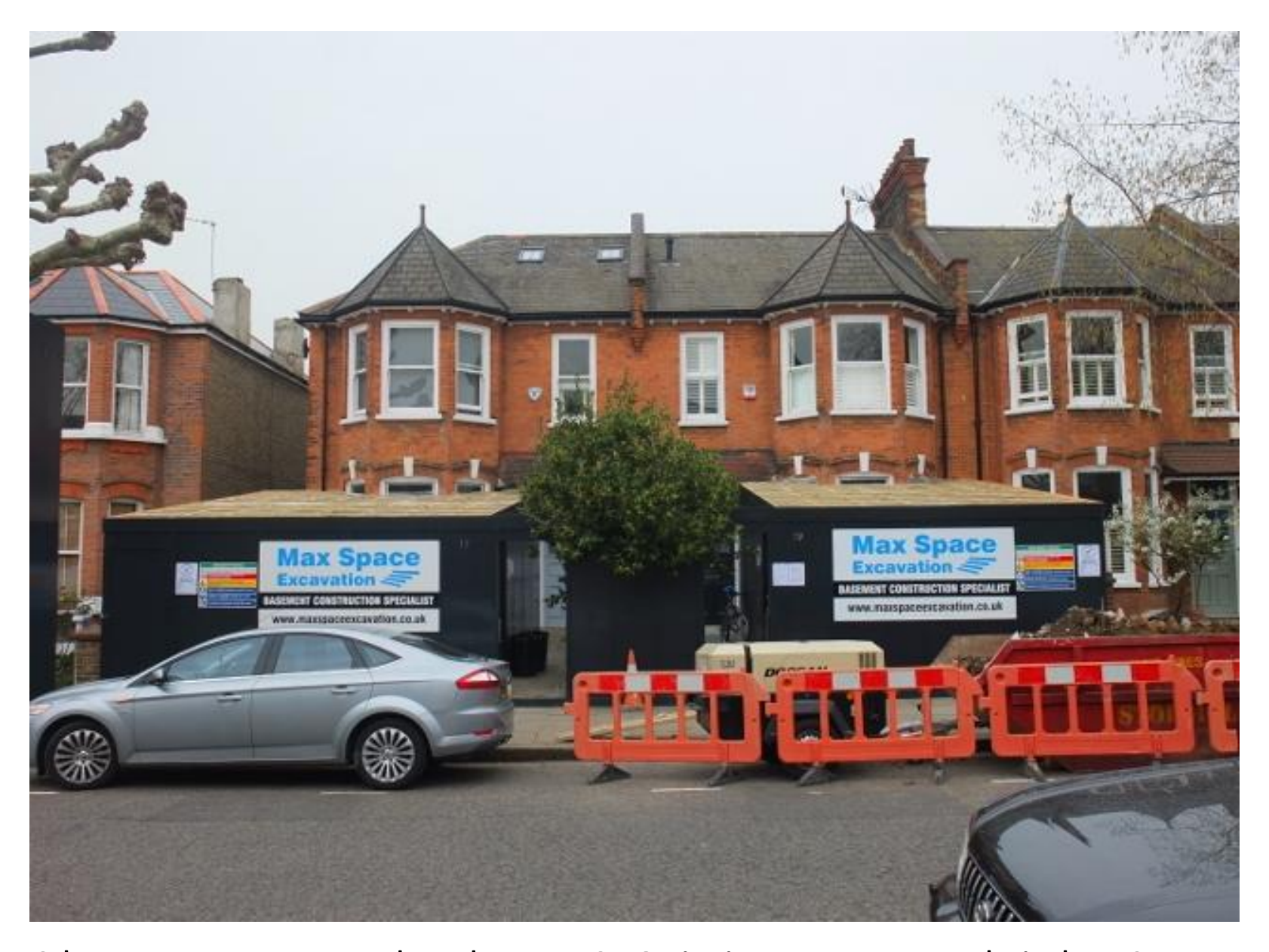
50 basements approved to date on St Quintin Estate – mostly in last 2 years