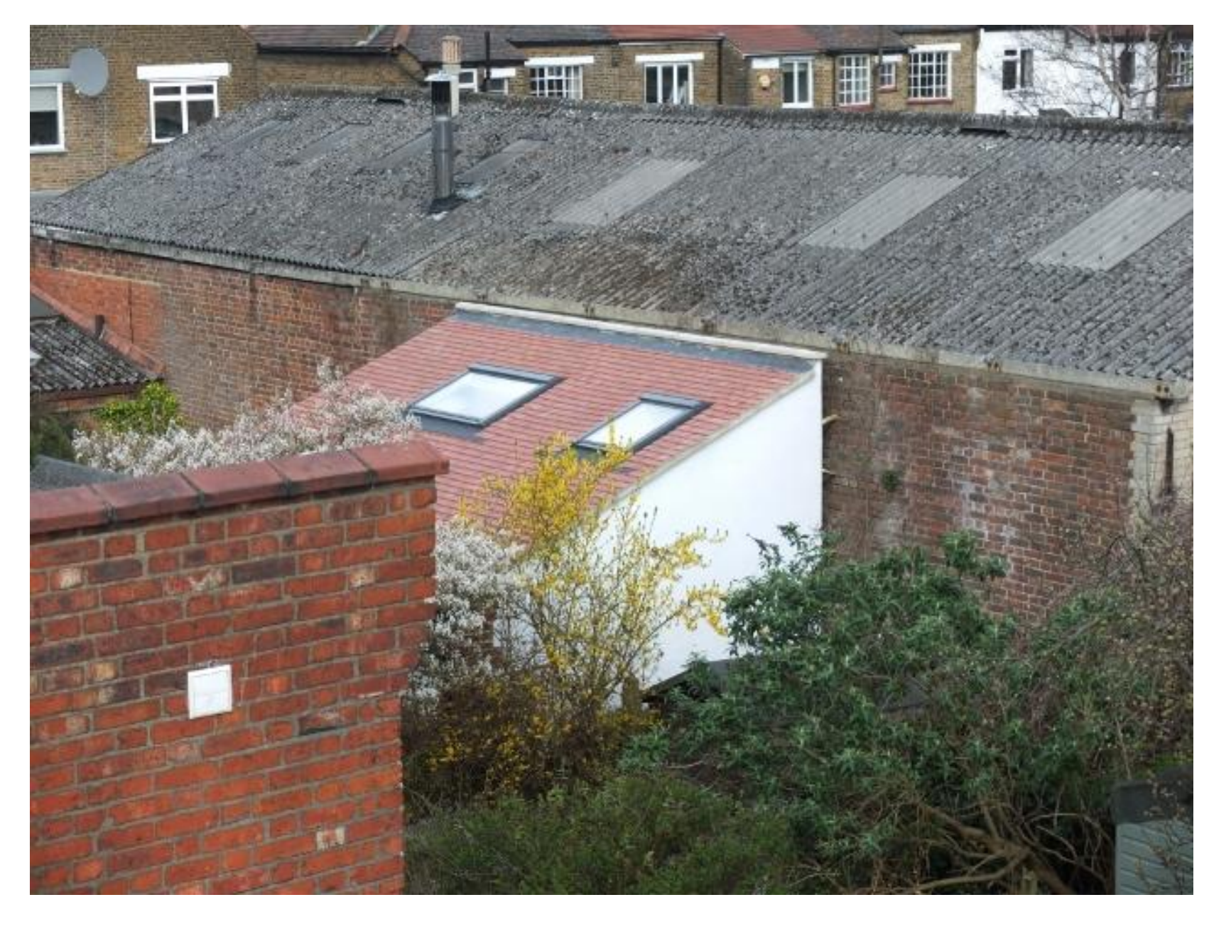
Limits on 'garden rooms' and 'studios' in rear gardens