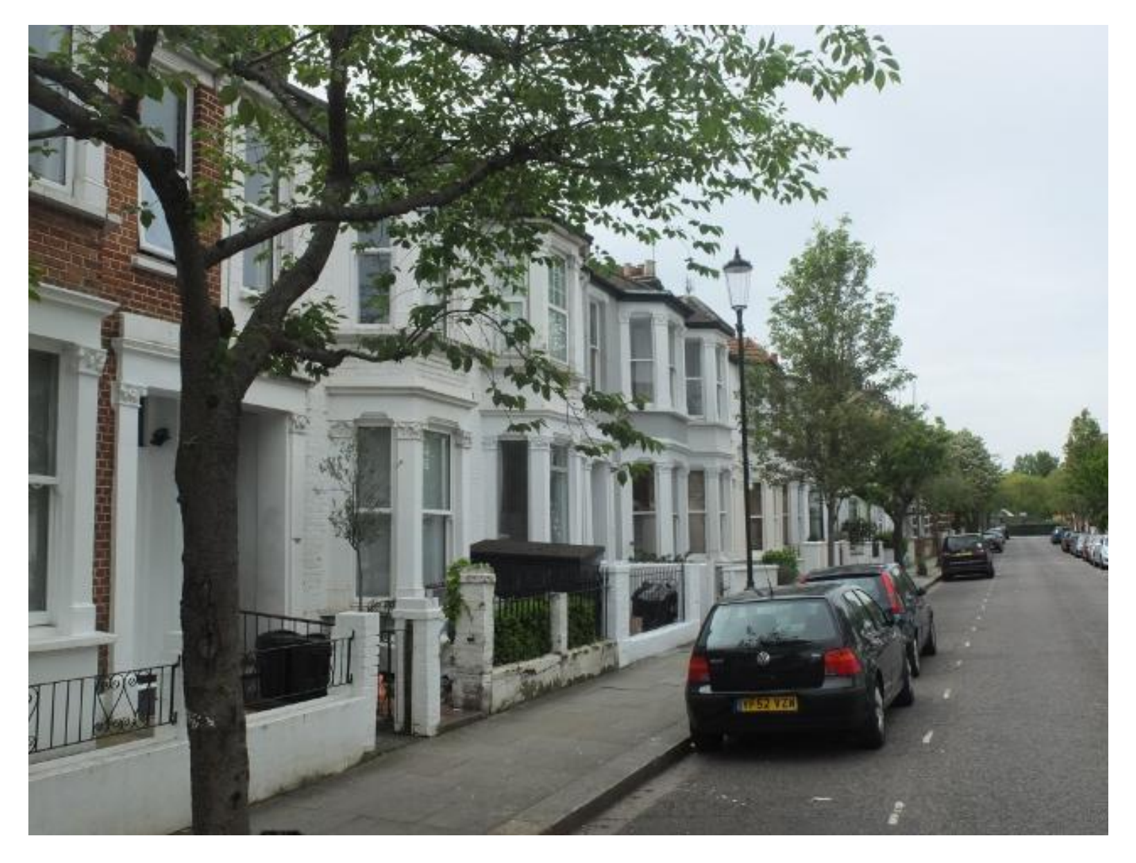
Painting of facades in other streets