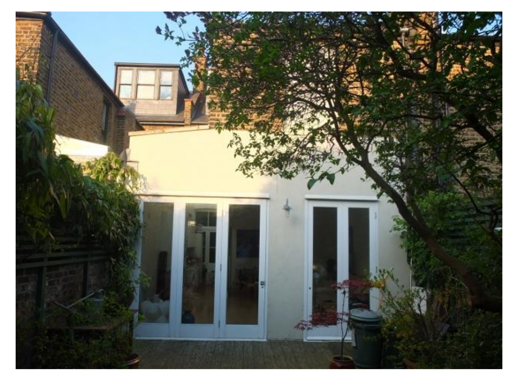
Full width extensions with side infill. OK or not OK?