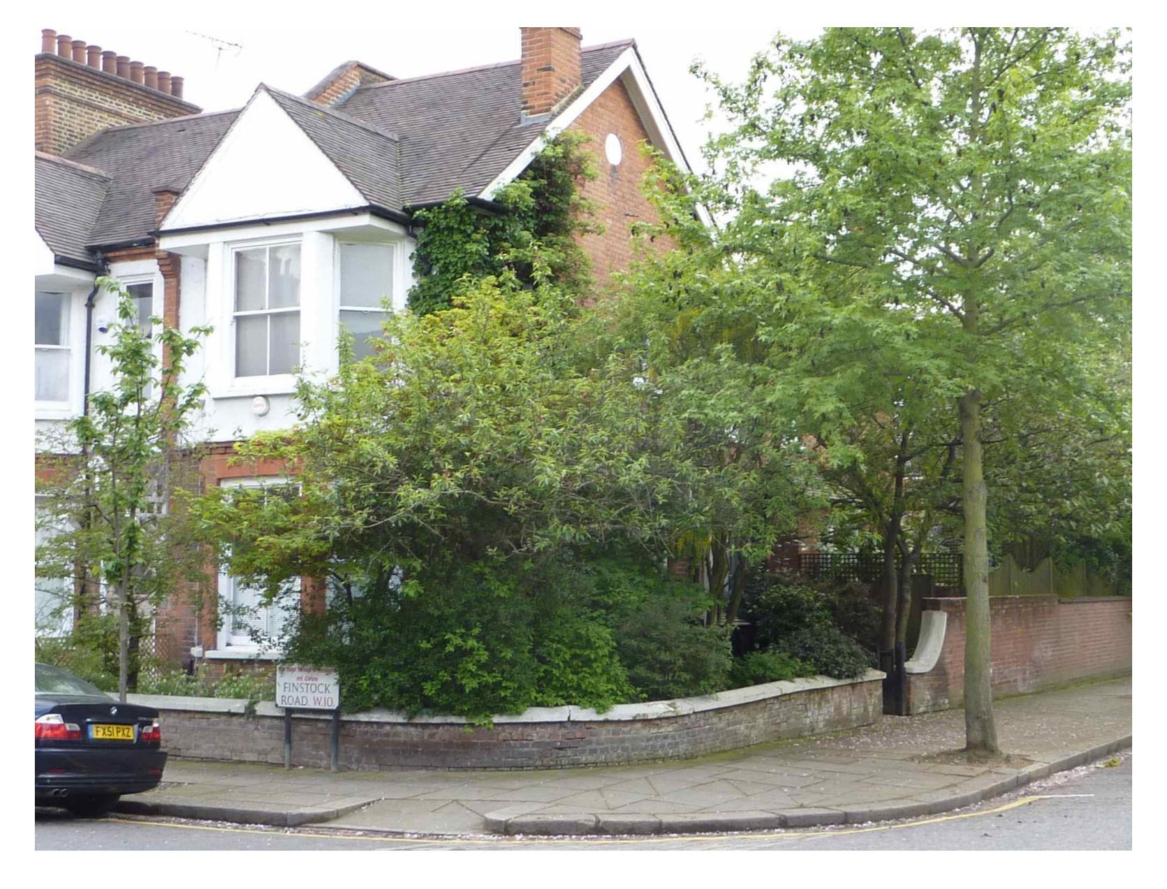
Front boundary wall/railings max 1.5m high Yes/No