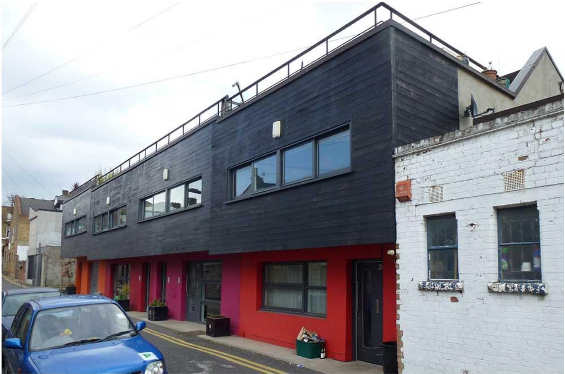
Mixed workshops and housing, Clarence Mews, Hackney