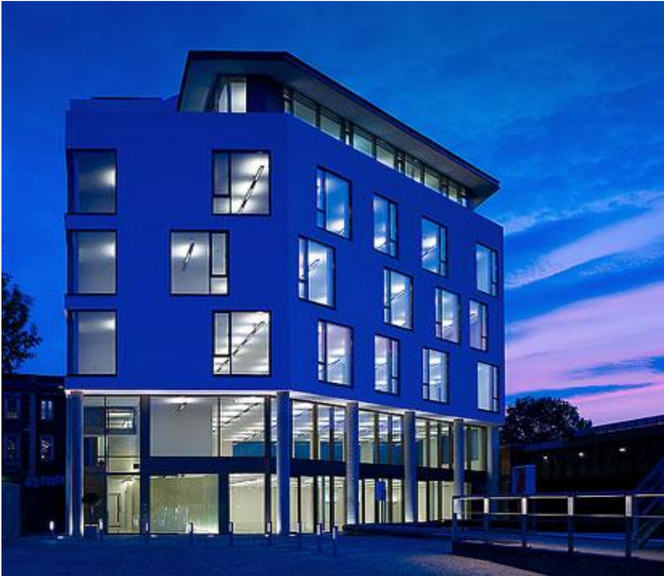
Canal Building, Portobello Dock (won a RBKC design award)