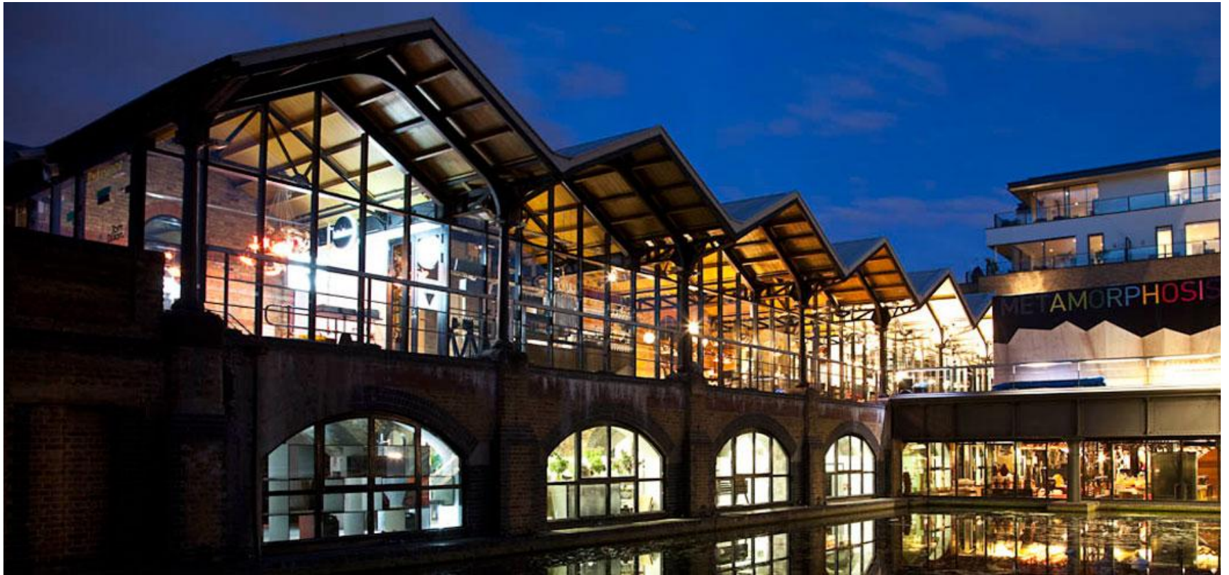
Dock Kitchen restaurant, Portobello Dock Only \frac{3}{4} of a mile away and showing what some investment and design can do