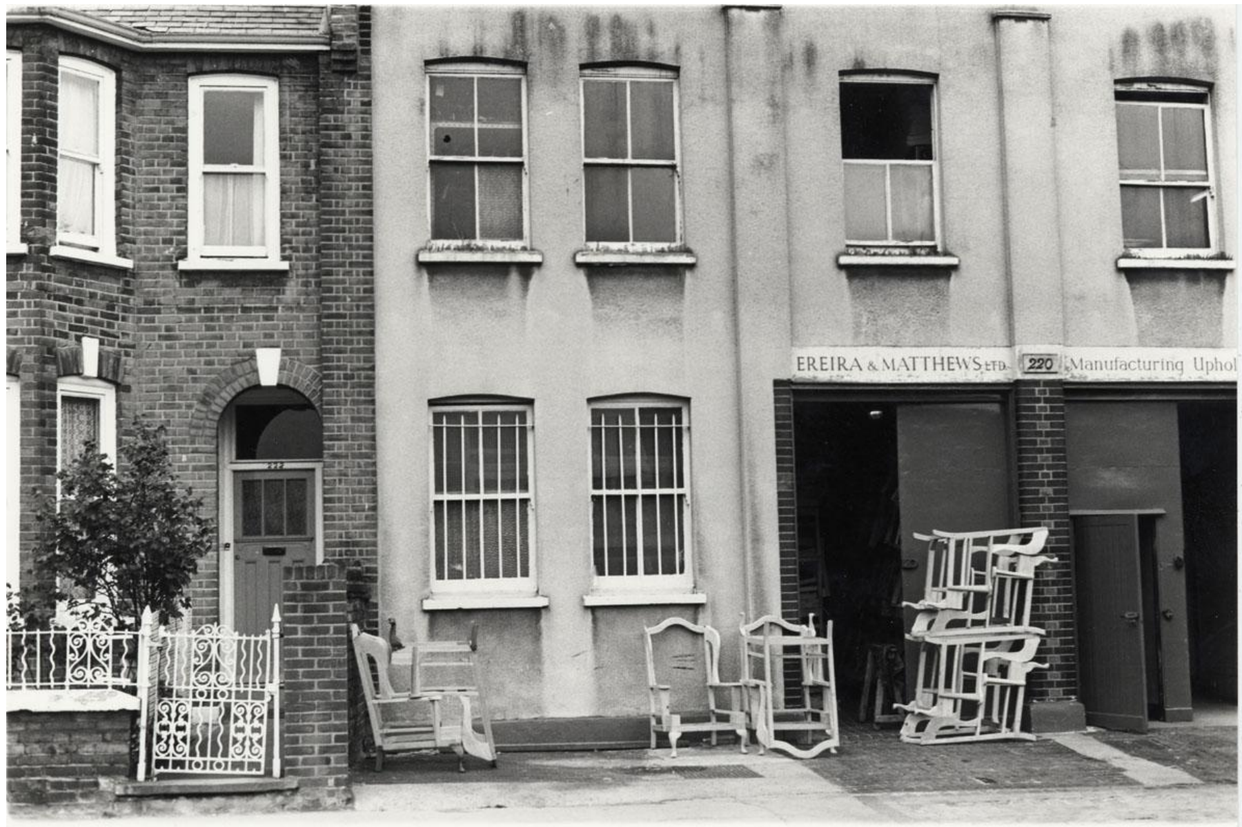
Latimer Road 1970s