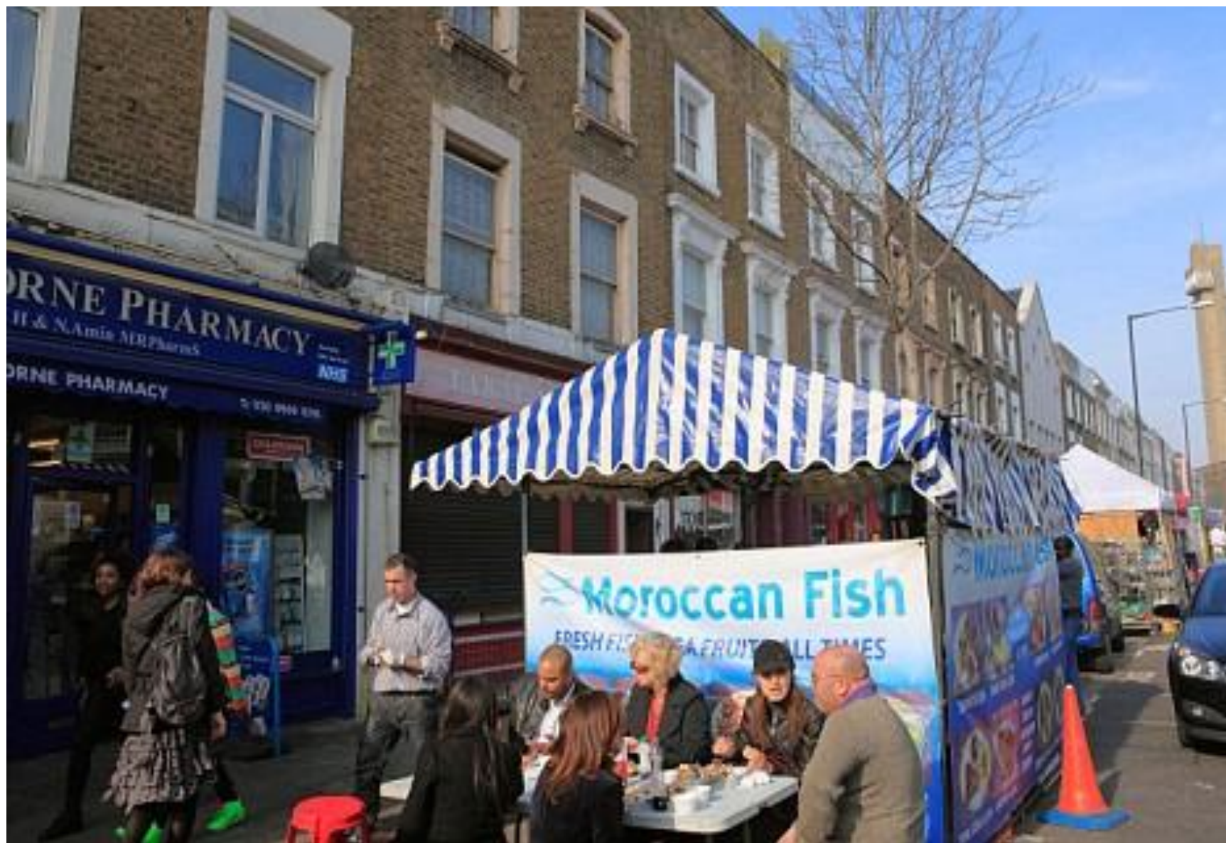
Golborne Road, North Kensington