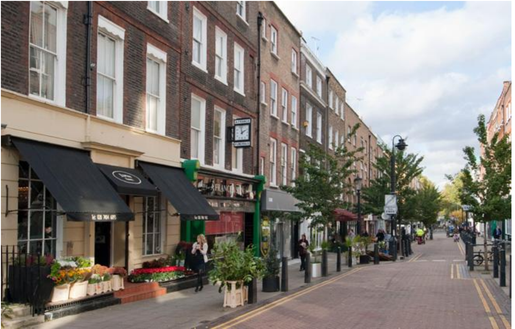
Lambs Conduit Street, Holborn