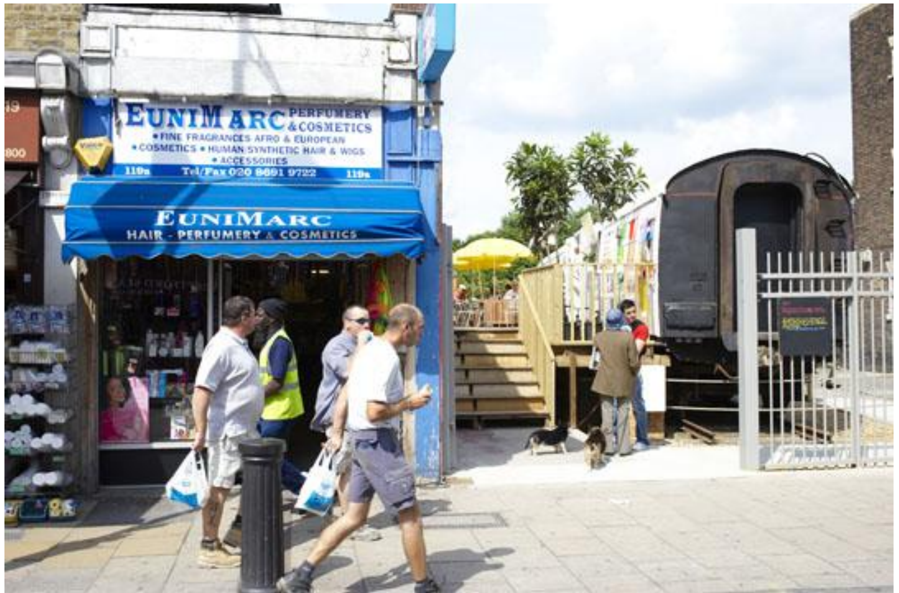
The Deptford Project