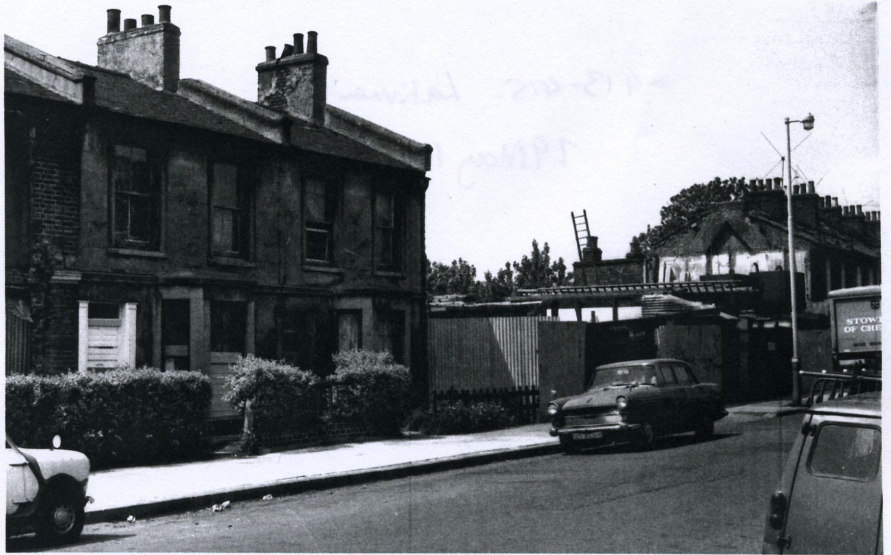
335 – 339 Latimer road 1977