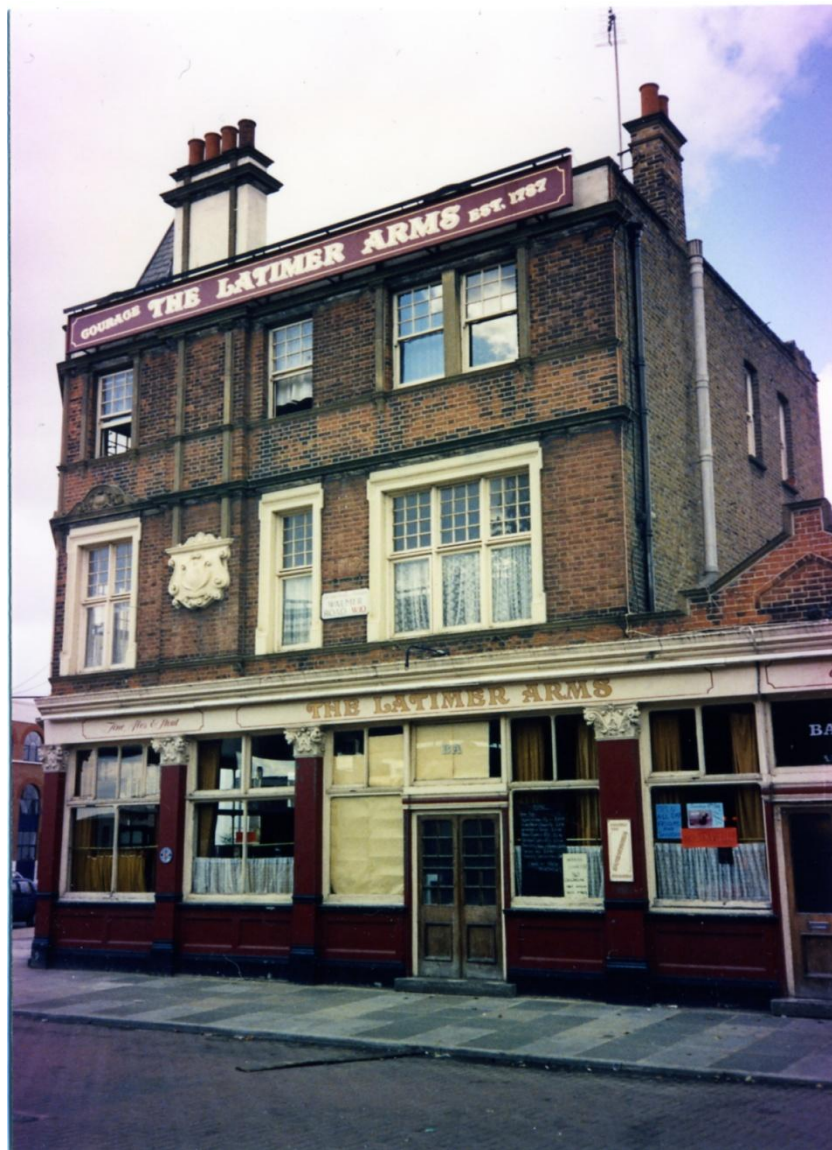
Latimer Arms (no pubs remain in Latimer Road. The Aphrodite is expected to changing use to residential above a wine bar/restaurant)