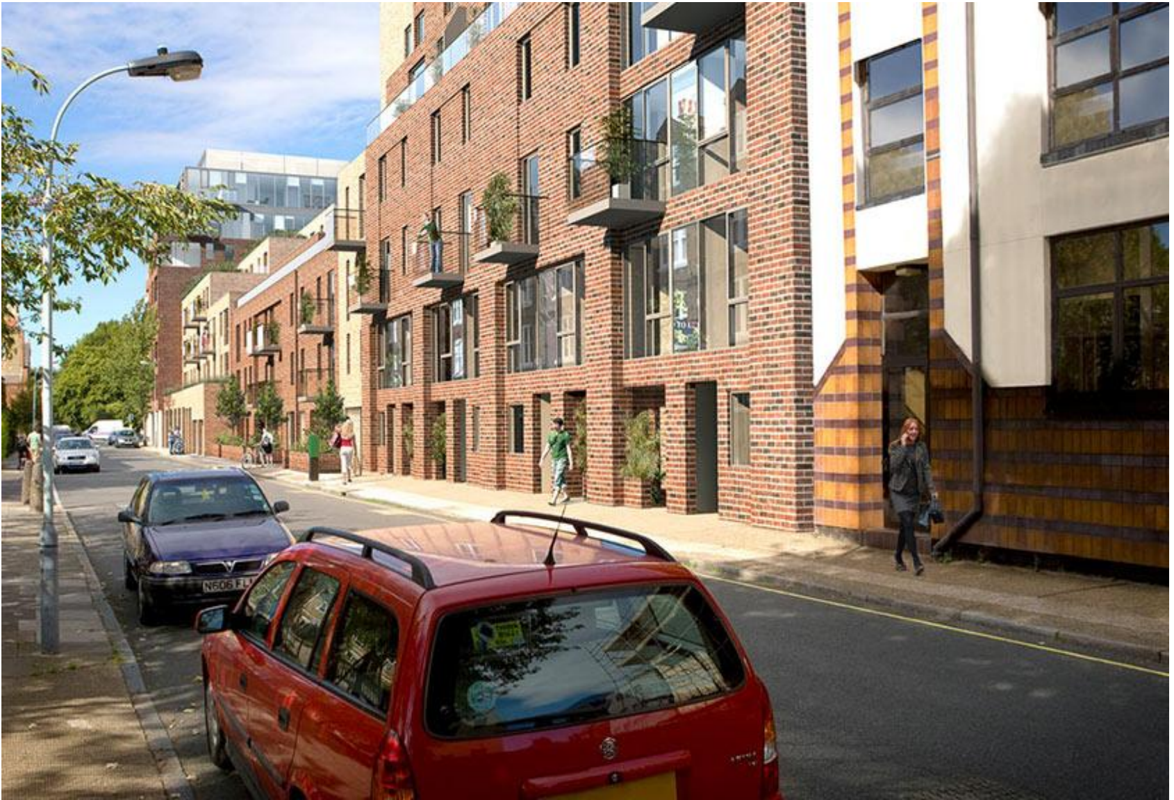
Proposed new mixed use development, King Street, Hammersmith