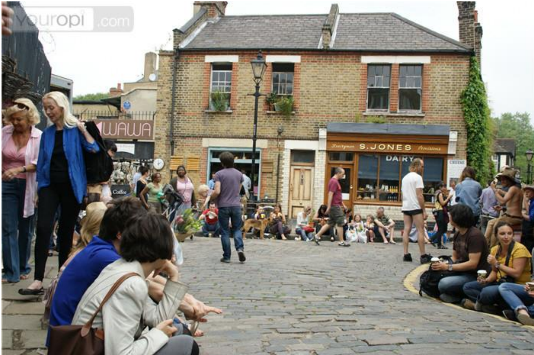
Columbia Road flower market, East End