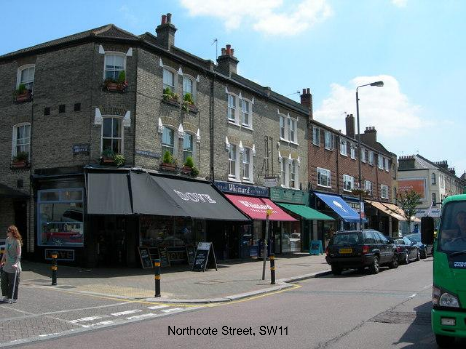
Northcote Street, SW11