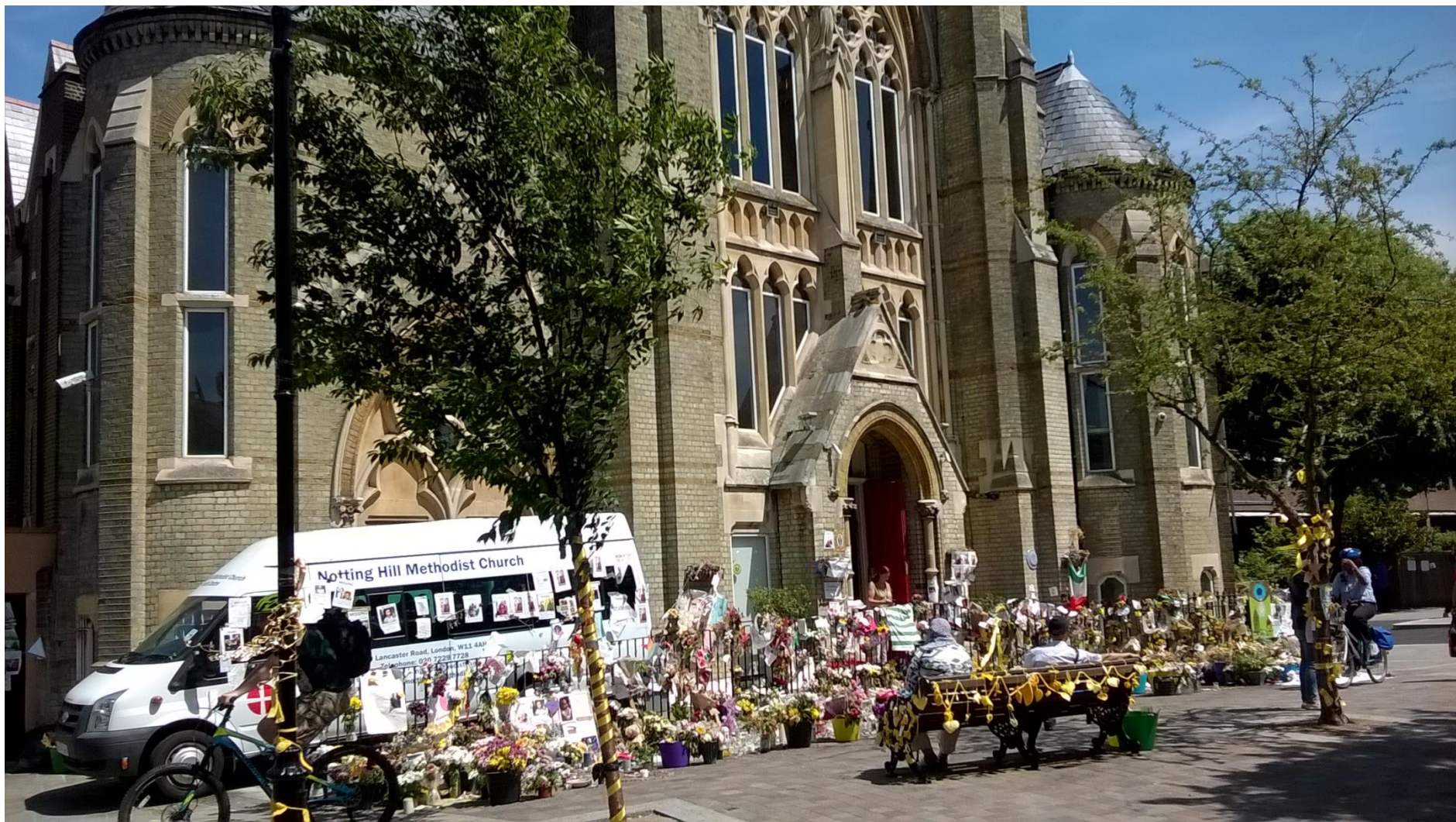
Notting Hill Methodist Church, Lancaster Road – donations of food and clothes distributed