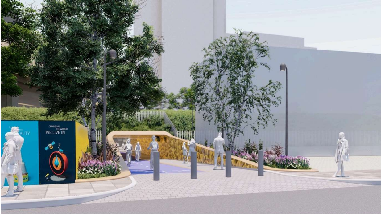
CGI of entrance/exit to underpass

The case for a connection across the West London Line has long been supported by both Boroughs. The rail line has divided the wider area since the 19th century, between North Pole Road and Shepherd's Bush. The sole intervening crossing point (via the road bridge giving vehicle access to Westfield from the West Cross Route) is not widely known or used.