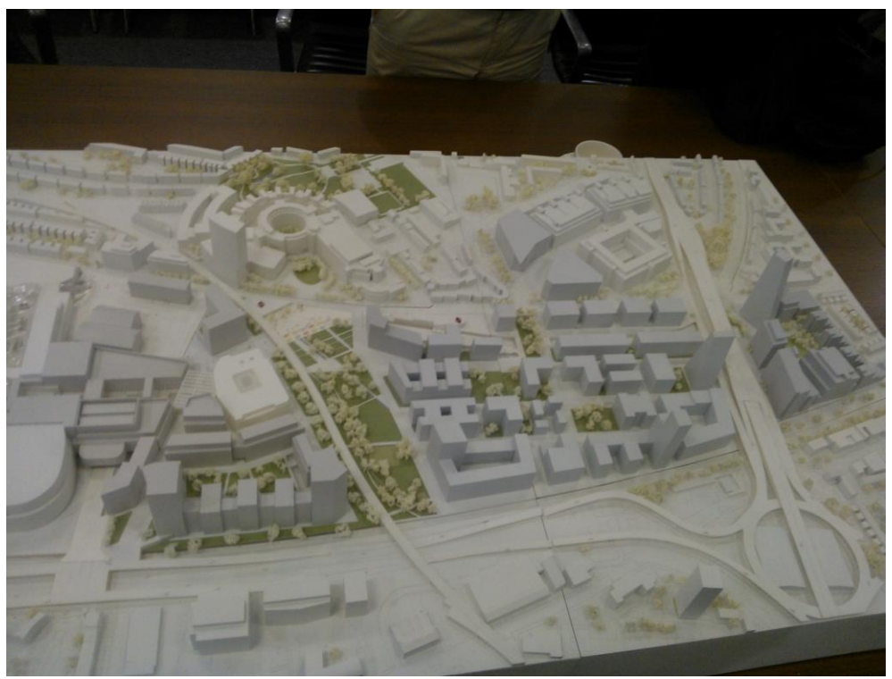
White City Opportunity Area Latest Proposals